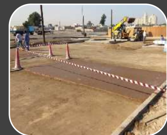
Natural colour - ClearTech seal