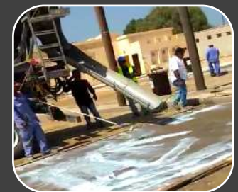
Priming the parking area