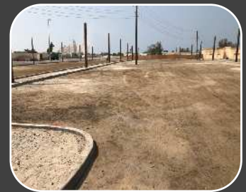
2019 – during construction