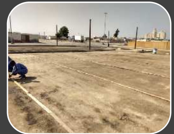
Preparing for seal